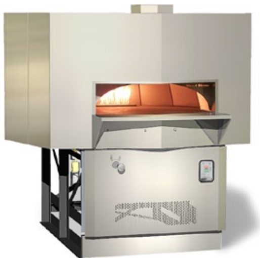
Oven shown with optional stainless steel mantle.