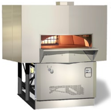
Gas oven shown with optional stainless steel mantle.