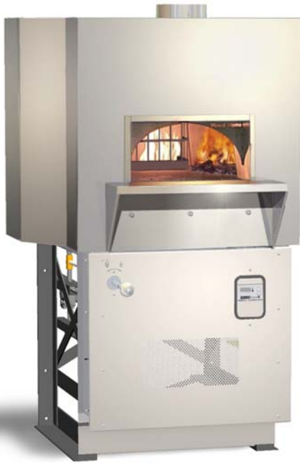
Oven shown with optional stainless steel mantle.