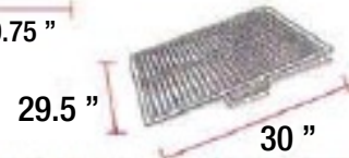
Measurements of cooking grill